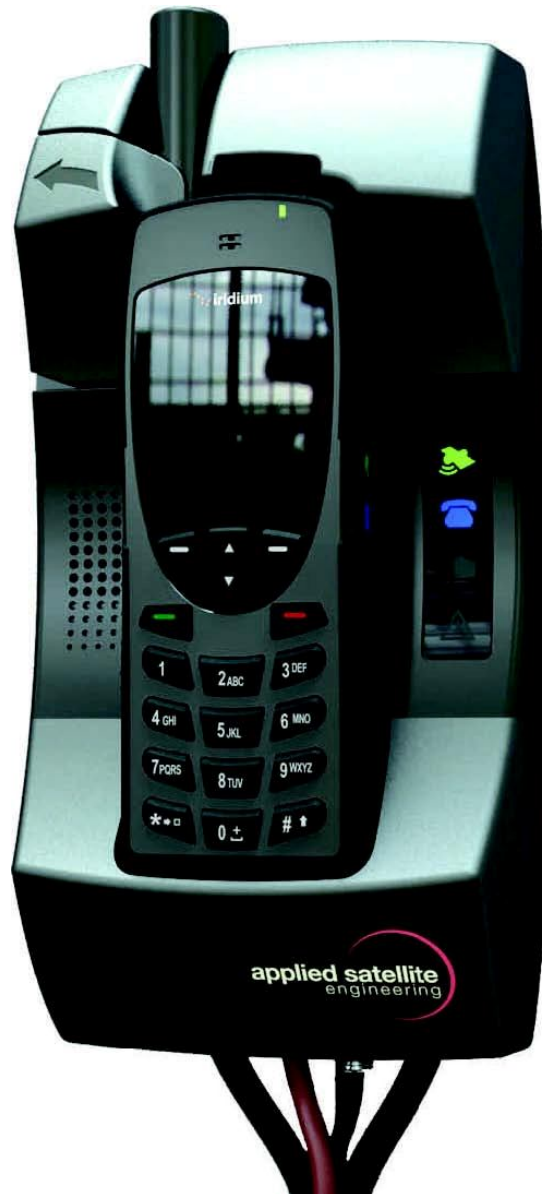
*DK075 unbundled shown

Hands-free operation allows you to multi-task while connected to the Iridium satellite network.